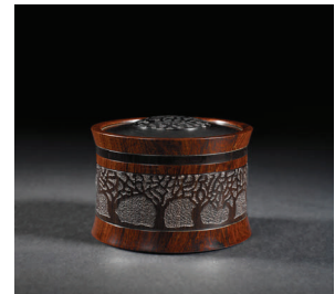
Steven Kennard "Lost Orchard Box - An Elegy"

Works Submitted – The Standards Committee requires at least three (3) and no more than (6) examples of your work. The applicant is asked to identify which three (3) objects he/she considers as the best examples of his/her work, but the Committee members will determine which three objects on which they will specifically comment. It is important that applicants submit not only their very best work for consideration, but also examples that show the range and scope of their work; if you work in multiple media or employ a variety of techniques it is important to provide examples of each. If you intend to participate in an NSDCC craft market, then it is essential to select examples that are representative of what you will want to sell at our markets. The Committee members also welcome supplementary photos to obtain a clear idea of the full body of work being proposed.