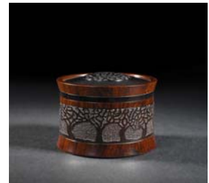
Steven Kennard "Lost Orchard Box - An Elegy"

Works Submitted – The Standards Committee requires at least three (3) and no more than (6) examples of your work. The applicant is asked to identify which three (3) objects he/she considers as the best examples of his/her work, but the Committee members will determine which three objects on which they will specifically comment. It is important that applicants submit not only their very best work for consideration, but also examples that show the range and scope of their work; if you work in multiple media or employ a variety of techniques it is important to provide examples of each. If you intend to participate in an NSDCC craft market, then it is essential to select examples that are representative of what you will want to sell at our markets. The Committee members also welcome supplementary photos to obtain a clear idea of the full body of work being proposed.